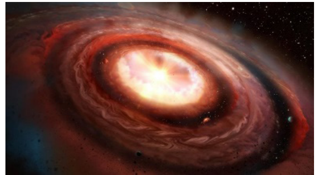
Fig. 1 Illustration of a model showing how gas giants such as Jupiter, Saturn, or Uranus could form quickly in the solar system from the dust of a protoplanetary disk and then drive dust into areas outside their orbit [3].