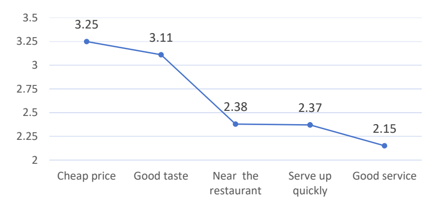
Figure 4. The influence of various factors in the choice

deeply with Generation Z consumers. This emotional connection enhances their loyalty and adds a layer of emotional value, which influences their purchasing decisions just as much as the price.