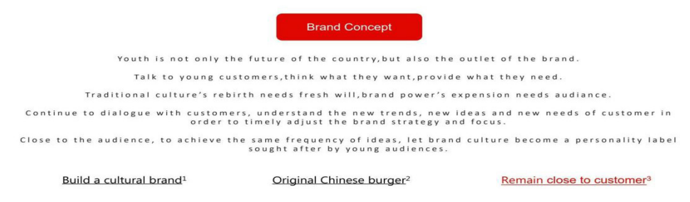
Figure 1. Brand concept from Tastien official website [11]

A significant number of respondents reported that they have a Tustin outlet near their university or workplace. It is obvious that the location of Tastien's stores satisfied the requirement of the target market. Moreover, the brand concept in its official website also clearly states that it sticks to the young group in Figure 1. Arguably, the positioning of the target customer groups of Tastien fit in with the actual market situation. In conclusion, it is safe to say that the rapid expansion of Tastien in recent years is closely related to the accurate target market positioning.