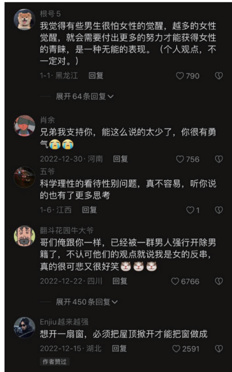
Fig 1. 3 Screenshots from three bloggers' comment sections, which represent support voices from some male netizens