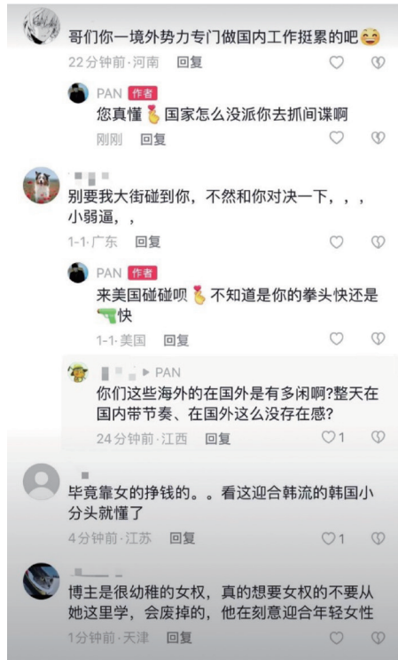
Fig 2. 7 Screenshots from three bloggers' comment section which

represent opposing voices from some male netizens.