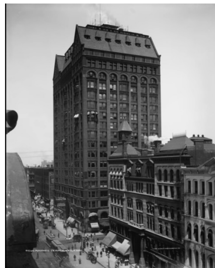
(Fig4)History of Skyscraper. Harvard Online Daniel Burnham and John Root ,19century Chicago

We just mentioned that this building was the first in history to be equipped with elevators, and the impact of elevators on buildings is enormous. In the documentary "History of Skyscrapers," it was mentioned that "the emergence of elevators is very important because only with elevators can tall buildings be built, and no one is willing to spend a lot of time climbing stairs.