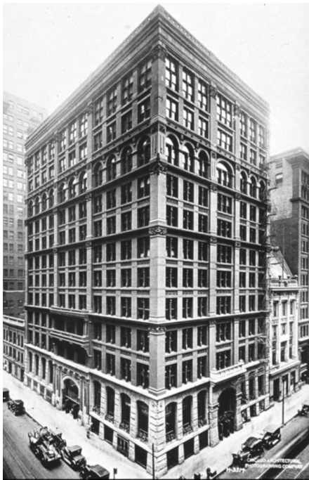
(Fig1) Chicago’s home insurance building ,built in 1884

Why build tall buildings? Firstly, we need to clarify that the first building defined as a high-rise appeared in 1884 (This image is from the documentary “History of Skyscrapers” Harvard online).