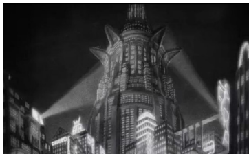
(Fig5)Blade Runner Scott, Ridley, director.

Firstly, when we observe current cities such as Shanghai, New York, etc., we can find that most high-rise buildings are located in the city center. The characteristic of the city center is that it has a good geographical location at the center of the city and enjoys the best commercial districts. Generally, those who possess these characteristics, whether they are residential or office buildings, have one characteristic - expensive prices. So generally, those who can own property in such areas are wealthy people. In this era, high-rise buildings have gradually become representatives of the wealthy. The higher you live, the richer and more powerful you are. The middle class can only live in ordinary buildings and areas, while the poor are even homeless. This scene is very evident in the movie "Blade Runner" 2 , which tells the story of the changes that will happen in Los Angeles in the future. There is a scene where the rich live in high-rise buildings and control technology and the economy, while the poor can only live next to the bottom garbage dump and be slaughtered.