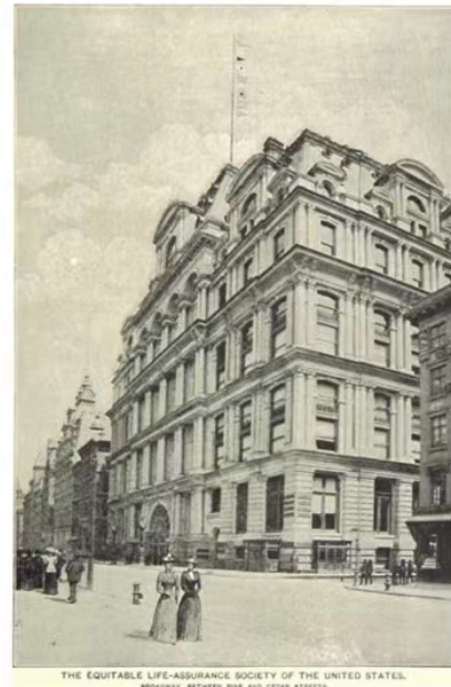
(Fig3)History of Skyscraper. Harvard Online 1870, Build in New York City

The building in the picture below was built in 1870 and is located in New York City. This is the first building equipped with elevators, which also laid the groundwork for the appearance of high-rise buildings in the future (Image source from the documentary "History of Skyscrapers" Harvard Online).