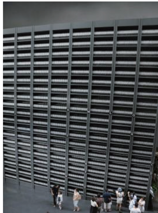
Image 3 The Witness Wall