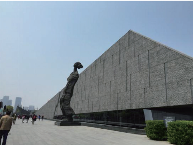
Image 1 The Sculpture Square and A Ruined Family

Family Ruined Never returns the son killed, Never returns the husband buried alive, Miseries drowns the wife raped, Good heavens! (The Memorial Hall of the Victims of the Nanjing Massacre by Japanese Invaders)