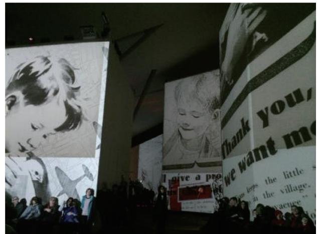
Image 7 Big Picture Show

The content of the Big Picture Show ( Image 7 ) contains six topics. They are: The War at Home, which looks at the experience of people on the home front during the Second World War; Remembrance, which focuses on the different elements of remembrance, from the First World War to Iraq; Children at War , which explores children's perspectives of conflict from the Second World War through to today; Build the Truce which is inspiring by the Olympic Truce and looking at the concepts of truce; Al Mutanabbi Street which is a creative response to a bomb attack on Baghdad's Al-Mutanabbi Street'(Ibid.).