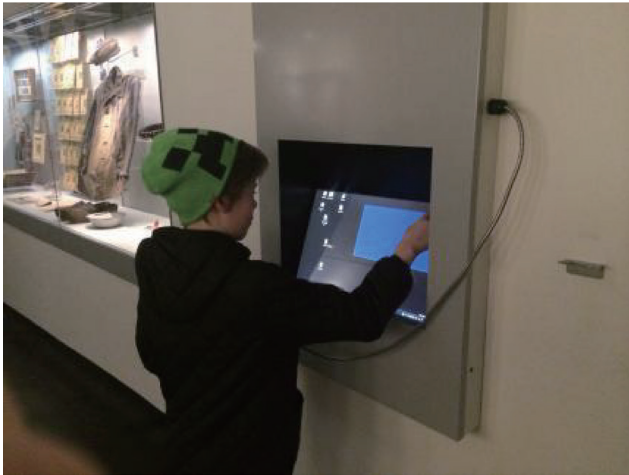
Image 8 Interactive Installation