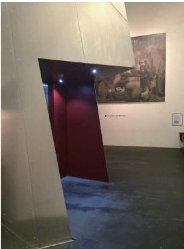
Image 6 Inner space of IWMN

in multiple ways. Apart from the normal photo, video, and text methods, it also has unique architecture and a distorted inner space. In addition, it is the first war museum which applies interactive audio-visual displays. The building is an interpretation of wars and conflicts, and it can animate memories and stories. Specifically, it was hard to find the entrance when we visited IWM North. It is an unnoticeable and small entrance gate located at the corner of the building. The primary intention of the narrow and decentralized gate is the theme of wars. The sharp shape of the ceiling and the sloping walls ( Image 6 ) immerse the the audience themselves into an uncertain and precarious space.